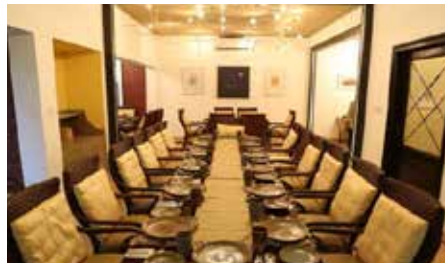
Paturi Banani 11, Dhaka Fine dining of classic Bangladeshi cuisine 20-minutes drive from venue