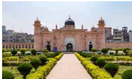
Lalbagh Fort Lalbagh Rd, Dhaka 1-hour drive from venue