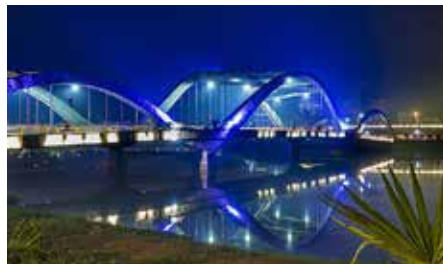
Hatirjheel Hatirjheel, Dhaka 30-minutes drive from venue