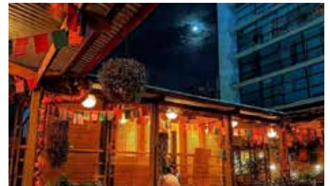
Jatra Biroti Banani, Dhaka Locally sourced organic and vegetarian restaurant. 18-minutes drive from venue