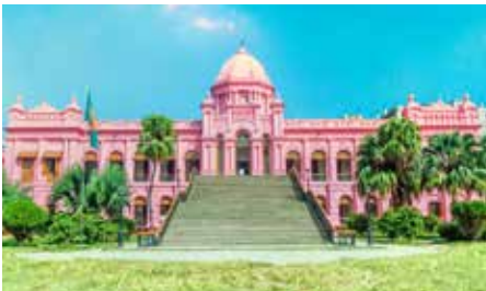
Ahsan Manzil Islampur Rd, Dhaka 1.1-hour drive from venue