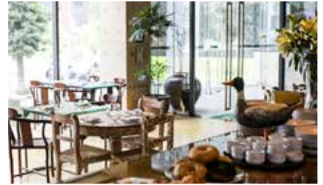
Oro Gulshan Ave, Dhaka Authentic Italian Cuisine 25-minutes drive from venue