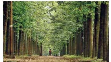
National Botanical Garden Mirpur, Dhaka 35-minutes drive from venue