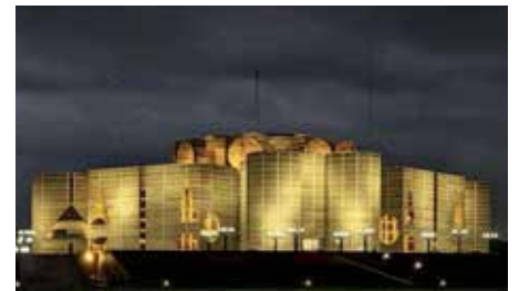
Bangladesh National Parliament Sher-e-Bangla Nagar, Dhaka 35-minutes drive from venue