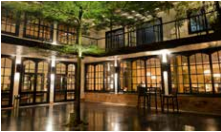
Izumi Japanese Kitchen Gulshan 01, Dhaka Sushi, Maki Rolls, Wagyu, Kobe 20-minutes drive from venue