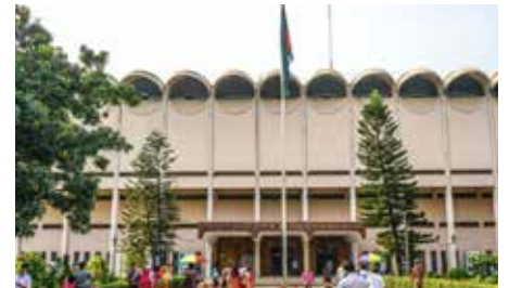
Bangladesh National Museum Shahbag, Dhaka 50-minutes drive from venue