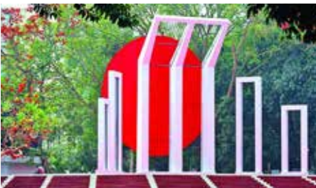
Shaheed Minar Secretariate Road, Dhaka 55-minutes drive from venue