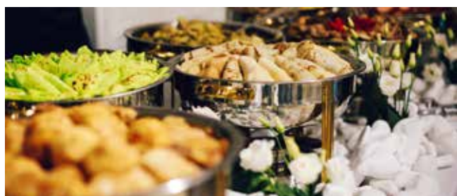
Lunch: 01:15PM – 02:00PM

The lunch and dinner are included in your ticket. The conference lunch will be served at the event hall and the dinner will take place at the Noboratri Hall of ICCB. For your convenience, the venue for dinner is situated inside the ICCB complex, just a short walk from the event hall. This would be a fantastic opportunity to relax and socialise with fellow participants.