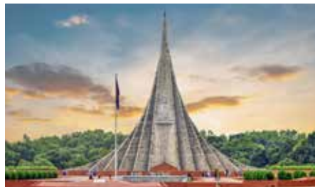
National Martyrs' Memorial Savar, Dhaka 1.5-hour drive from venue