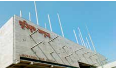
Liberation War Museum Agargaon, Dhaka 40-minutes drive from venue