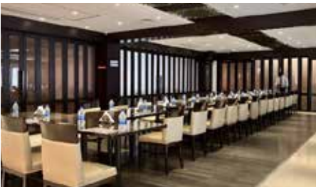
Premium Sweets Bangladesh Gulshan 02, Dhaka Traditional Bengali savoury dishes and sweets 15-minutes drive from venue