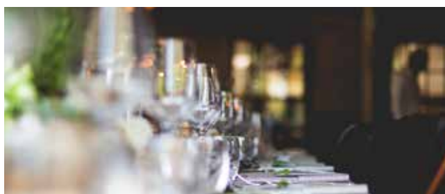
Dinner: 07:30PM – 09:00PM