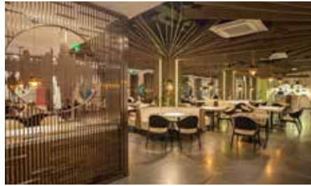
Hongbao Gulshan 01, Dhaka Contemporary Chinese Cuisine 25-minutes drive from venue